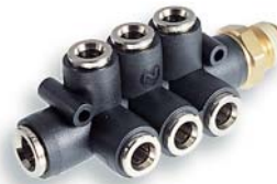
Manifold* (O/D tube)