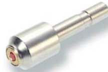
Pneufit Pressure Indicator