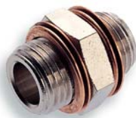
Pneufit ISO G Hex Nipple (Supplied with sealing washers)