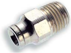
Pneumatic Male Adapter