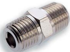
Pneufit ISO R Hex Nipple