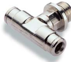
Pneufit ISO R Swivel Male Tee