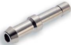
Pneufit Barb Adapter